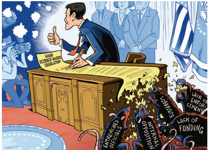
Figure 1 • A cartoonist's view of science in the social and political context. With kind permission of the Union of Concerned Scientists, http://go.ucsusa.org , and the artist, Kevin Cannon. Each year the Union of Concerned Scientists sponsors a contest for the best cartoons depicting the interaction between science and politics.

RECEIVED: 24 OCTOBER 2014 ACCEPTED: 25 OCTOBER 2014